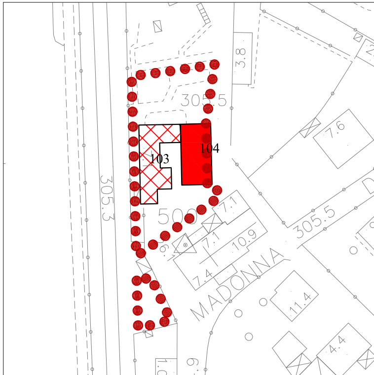
Località MADONNA DEL NOCE