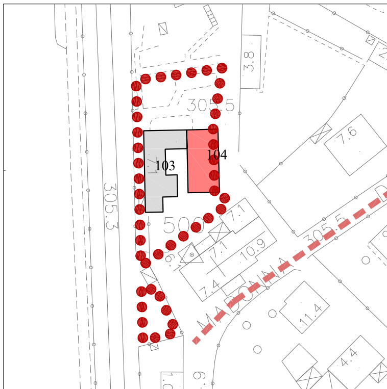
Località MADONNA DEL NOCE