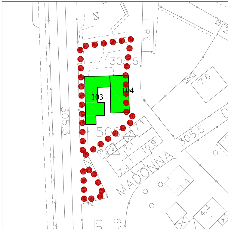
Località MADONNA DEL NOCE