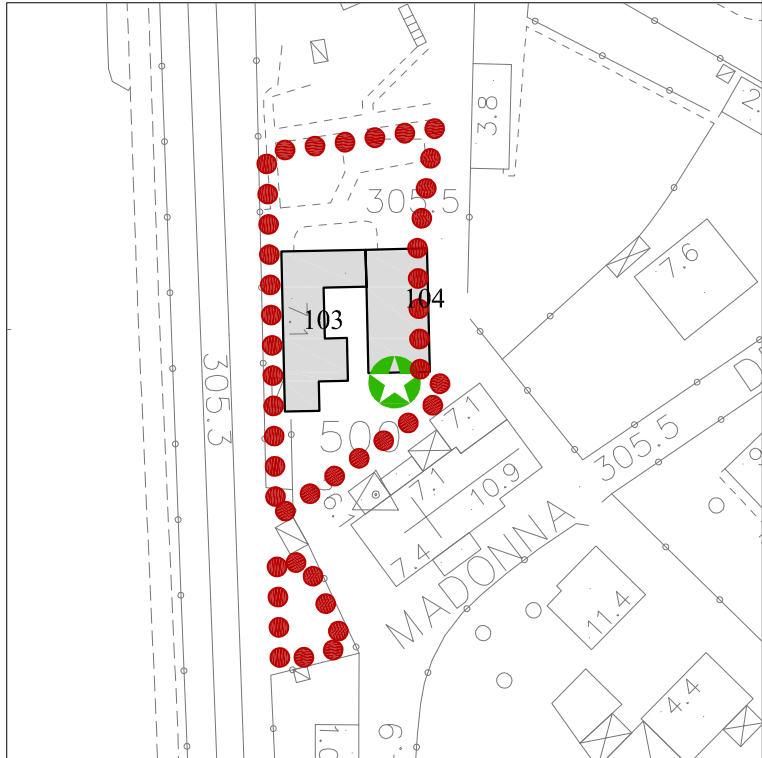
Località MADONNA DEL NOCE